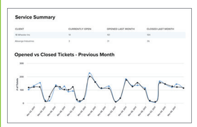
Example Service Summary Dashboard