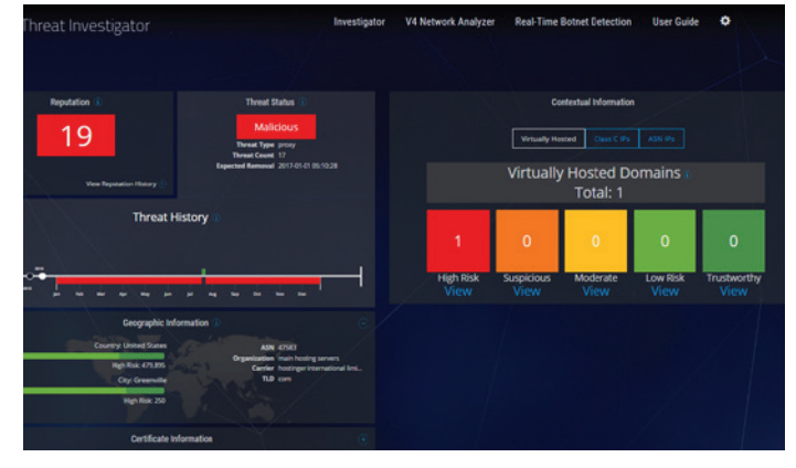
Additional intelligence is made available for each threat actor