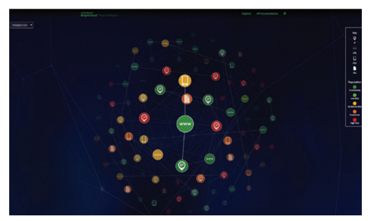
BrightCloud® Threat Investigator provides contextual intelligence on the relationships between IPs, URLs, files and mobile apps

Using our intuitive software development kit (SDK), REST services, and API, partners can easily integrate the BrightCloud Threat Intelligence Services into their own solutions. The BrightCloud Threat Investigator is available for Webroot technology partners using the BrightCloud SDK V5.20 and above as well as via BrightCloud REST APIs. This intelligence can be incorporated within the network device interface for the end customers' use.